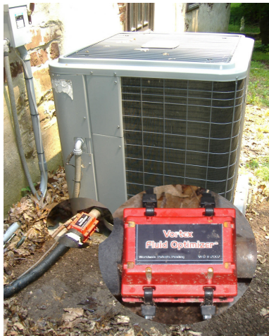
Clamp-on double unit on large line going into the compressor

Vortex Heat Pump Optimizers save 15% on heating and cooling.