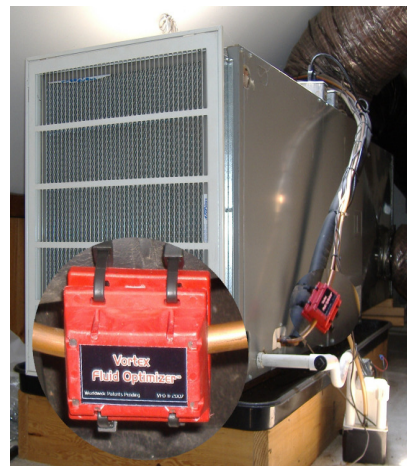
Clamp-on Unit and back plate on small copper line going into air handler